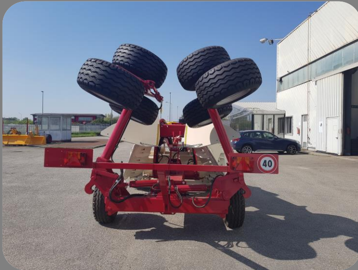
Closed butterfly axle